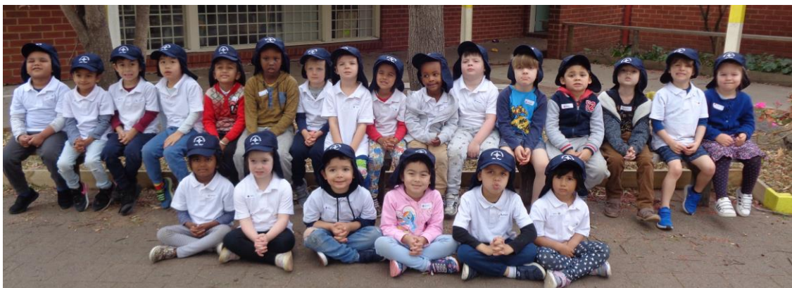
Our 2020 Foundation students

Our Values: Respect, Honesty, Care, Learning and Achievement