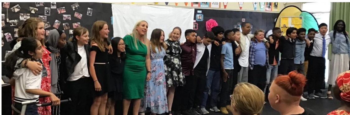
Year 6 graduates (with their teachers)