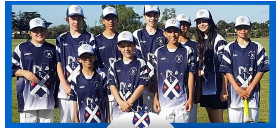
ST. ANDREWS FOOTSCRAY CRICKET CLUB