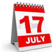
Pupil Free Day

Monday 6 th November. On this day, staff will be working on assessment and reporting matters.