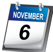
Pupil Free Day

Students do not attend school on these days.