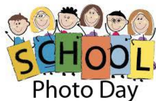
Photo Day Wednesday 31 st May

School photos will be taken on Wednesday 31 st May. Order envelopes were sent home last Thursday. The eldest child in each family also received a family photo order envelope. If you did not receive an envelope, your child's classroom teacher may have it. Otherwise, there are spare envelopes at the office. There are also spare family envelopes at the office. If you are ordering photos, you need to make sure your child brings their envelope to school on photo day or prior to photo day. If you have ordered online, still bring the envelope to school on or before photo day.